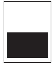
Half Page Vertical