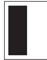
Half Page Horizontal